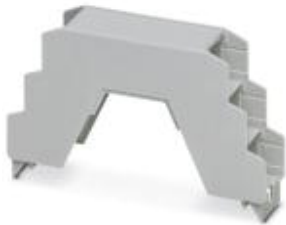
Upper part of housing, for COMBICON connection, three-level

Please be informed that the data shown in this PDF Document is generated from our Online Catalog. Please find the complete data in the user's documentation. Our General Terms of Use for Downloads are valid ( http://download.phoenixcontact.com )