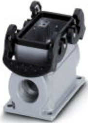
Figure shows a product variant with a height of 74 mm

HEAVYCON box mounting base B10, with double locking latch, height 52 mm, with supports 2xM20