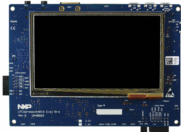
LPCXpresso54018 (OM40003) Development Board