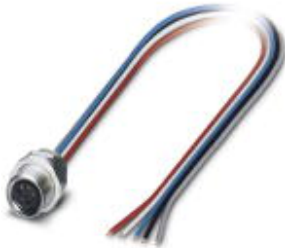
Bus system flush-type plug-in connector, socket, DeviceNet, 5-pos., M8, front/screw mounting with M10 fastening thread, with 0.5 m TPE litz wire, 5 x 0.25 mm 2

Please be informed that the data shown in this PDF Document is generated from our Online Catalog. Please find the complete data in the user's documentation. Our General Terms of Use for Downloads are valid ( http://download.phoenixcontact.com )