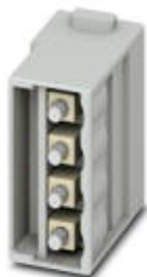
Contact insert module, number of positions: 4, Pin V, application: FO, for integration of up to 4 LC simplex connectors

Please be informed that the data shown in this PDF Document is generated from our Online Catalog. Please find the complete data in the user's documentation. Our General Terms of Use for Downloads are valid ( http://phoenixcontact.com/download )