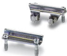
Adapter insert, type: D15

Please be informed that the data shown in this PDF Document is generated from our Online Catalog. Please find the complete data in the user's documentation. Our General Terms of Use for Downloads are valid ( http://phoenixcontact.com/download )