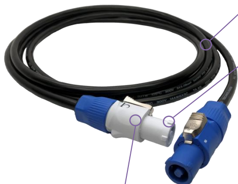
IO-PRCPTP-14-10 (left) IO-PRCPTE-14-25 (right)

Each connector is keyed differently to eliminate the possibility of inter-mating. Locking mechanism virtually eliminates accidental unplugging