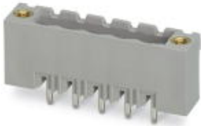
The figure shows a 5-pos. version of the product in gray

Header, Nominal current: 12 A, Rated voltage (III/2): 320 V, Number of positions: 20, Pitch: 5.08 mm, Color: pastel green, Contact surface: Tin, Mounting: Soldering