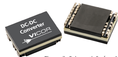
Thermally Enhanced, Surface-Mount Power-System-in-Package (PSIP) 0.87" x 0.65" x 0.265" 22 mm x 16.5 mm x 6.7 mm Weight: 7.8 Grams