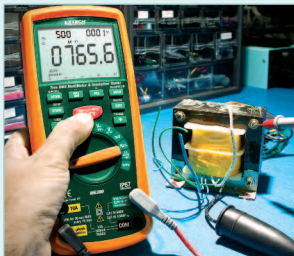
Measure the insulation resistance of transformer windings