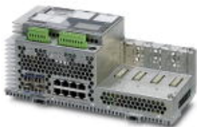
Gigabit Modular Switch with integrated routing function

Ethernet Gigabit Modular Switch with four 1000 Mbps combo ports and twelve 10/100 Mbps RJ45 slots, can be extended by an extension station to up to 24 ports, with integrated routing function