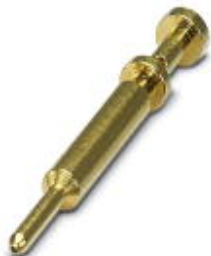
Crimp contact, turned, contact diameter: 1 mm, crimp range: 0.34 mm 2 ... 0.5 mm 2

Please be informed that the data shown in this PDF Document is generated from our Online Catalog. Please find the complete data in the user's documentation. Our General Terms of Use for Downloads are valid ( http://phoenixcontact.com/download )