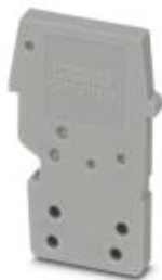
End cover, length: 17.8 mm, width: 3 mm, height: 27 mm, color: gray

Please be informed that the data shown in this PDF Document is generated from our Online Catalog. Please find the complete data in the user's documentation. Our General Terms of Use for Downloads are valid ( http://phoenixcontact.com/download )