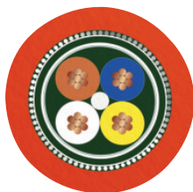
Sercos III [93K]