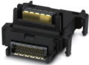
Axioline F bus base module for housing type H

Please be informed that the data shown in this PDF Document is generated from our Online Catalog. Please find the complete data in the user's documentation. Our General Terms of Use for Downloads are valid ( http://phoenixcontact.com/download )