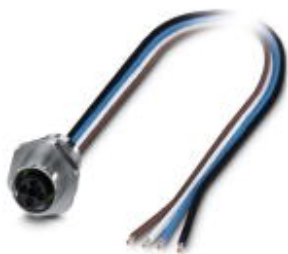
Flush-type connector, Power, 4-position, Socket, Link: M12, T power, Front mounting, M16 x 1.5, Individual wires, Cable length: 0.5 m

Please be informed that the data shown in this PDF Document is generated from our Online Catalog. Please find the complete data in the user's documentation. Our General Terms of Use for Downloads are valid ( http://phoenixcontact.com/download )