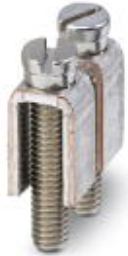
Fixed bridge, pitch: 6.2 mm, number of positions: 2, color: silver

Please be informed that the data shown in this PDF Document is generated from our Online Catalog. Please find the complete data in the user's documentation. Our General Terms of Use for Downloads are valid ( http://phoenixcontact.com/download )