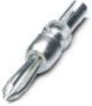
Test plugs, Color: silver