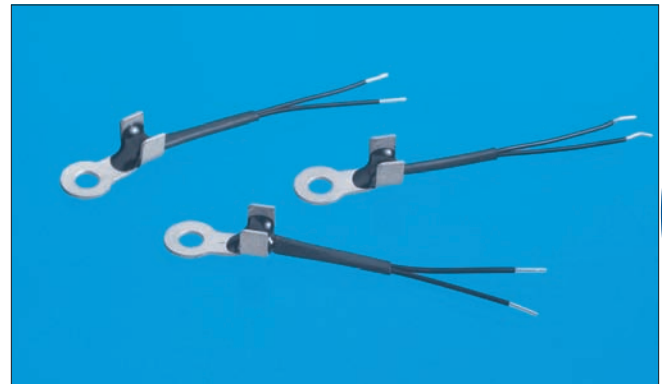
SS&C RT24 Surface Temperature Sensor