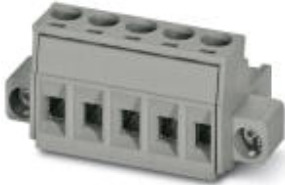
The figure shows a 5-pos. version of the product in gray

Plug component, Nominal current: 12 A, Rated voltage (III/2): 320 V, Number of positions: 2, Pitch: 5 mm, Connection method: Screw connection with tension sleeve, Color: black, Contact surface: Tin