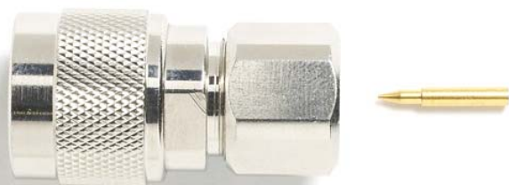
Model 73051 N Type Plug, 50 Ohm, Clamp Type, RG8, 213