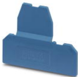
End cover, length: 67 mm, width: 2.5 mm, height: 62 mm, color: blue

Please be informed that the data shown in this PDF Document is generated from our Online Catalog. Please find the complete data in the user's documentation. Our General Terms of Use for Downloads are valid ( http://phoenixcontact.com/download )