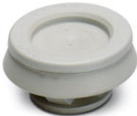
Membrane screw connection, Cable gland material: Polypropylene, Application: Standard, External cable diameter 9 mm ... 17 mm, Shielding: No, Connecting thread: M25, Color: lightgrey RAL 7035

Please be informed that the data shown in this PDF Document is generated from our Online Catalog. Please find the complete data in the user's documentation. Our General Terms of Use for Downloads are valid ( http://phoenixcontact.com/download )