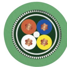
PROFINET PVC stranded CAT5e [93B]