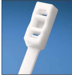
PLB4H Head Design