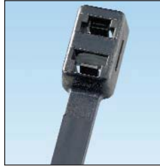
PLB2S/3S/4S Head Design