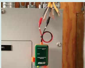
Use for local continuity or for remote wiring identification.

Continuity Tester includes Remote probe with bi-color LED for wire identification highlight