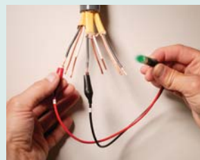
GREEN LED means wiring is properly identified.