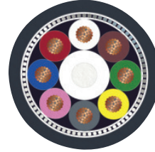
PUR halogen-free black shielded [PUR]