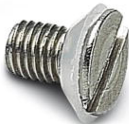
Sealing screw, size: Countersunk head V, IP67, replacement part for D7 size HEAVYCON housing

Please be informed that the data shown in this PDF Document is generated from our Online Catalog. Please find the complete data in the user's documentation. Our General Terms of Use for Downloads are valid ( http://phoenixcontact.com/download )