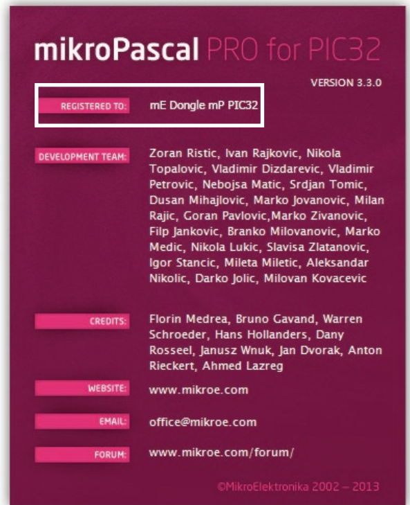
Figure 1-2: mikroPascal PRO for PIC32® About Window