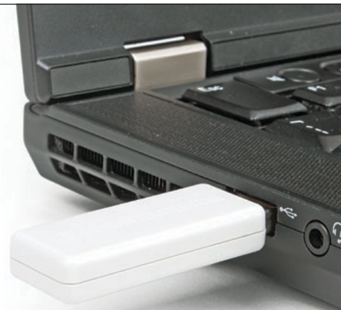
Figure 1-3: USB Dongle plugged into Laptop USB host connector

Unfortunately not. If you lose your dongle you will need to buy a new compiler license and pay the full price.