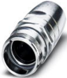
Sleeve housing for coupler connector, straight, Screw locking, M23, shielded: No

Please be informed that the data shown in this PDF Document is generated from our Online Catalog. Please find the complete data in the user's documentation. Our General Terms of Use for Downloads are valid ( http://phoenixcontact.com/download )