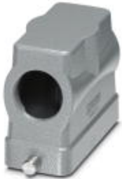
HEAVYCON B16 sleeve housing, for single locking latch, height: 76 mm, with 1 x M32 thread, lateral cable outlet

Please be informed that the data shown in this PDF Document is generated from our Online Catalog. Please find the complete data in the user's documentation. Our General Terms of Use for Downloads are valid ( http://phoenixcontact.com/download )