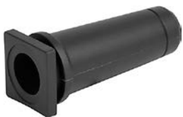
Cable Guard KT14 PVC Cable Guard for rewirable connectors