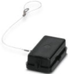
HEAVYCON protective cover, B10, for HC-EVO-B10... supporting base element, for single locking latch, with retaining cord with combination eyelet, IP54

Please be informed that the data shown in this PDF Document is generated from our Online Catalog. Please find the complete data in the user's documentation. Our General Terms of Use for Downloads are valid ( http://phoenixcontact.com/download )