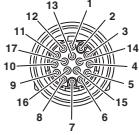
Connector pin assignment