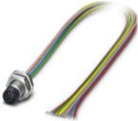
Sensor/actuator flush-type plug, 8-pos., M8, rear/screw mounting with M8 fastening thread, with 0.5 m TPE litz wire, 8 x 0.14 mm 2

Please be informed that the data shown in this PDF Document is generated from our Online Catalog. Please find the complete data in the user's documentation. Our General Terms of Use for Downloads are valid ( http://download.phoenixcontact.com )