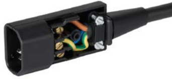
Example with assembled cable