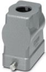
HEAVYCON B10 sleeve housing, for single locking latch, height: 72 mm, with 1 x M20 thread, straight cable outlet

Please be informed that the data shown in this PDF Document is generated from our Online Catalog. Please find the complete data in the user's documentation. Our General Terms of Use for Downloads are valid ( http://download.phoenixcontact.com )