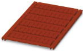
The figure shows the UCT-TM 6

UniCard materials for thermal transfer printer, for labeling Weidmüller, Conta Clip, and Klemsan terminal blocks, 60-section, can be labeled with THERMOMARK CARD and BLUEMARK LED, color: red